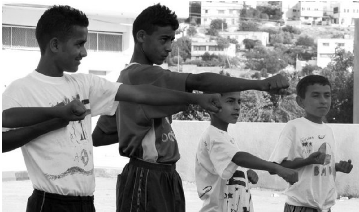
Camp participants in homemade T-shirts learn Judo Zarka June 2006

The major event of the summer in the village of Al-Alouk was the Al-Alouk Summer Camp for boys. I had my students design and run a summer camp for themselves with me acting as facilitator. They asked to learn Judo (which they are convinced every American knows very well), new games, more English - but in a fun way, paint the school, and teach me dubca (their traditional dance). I said yes to all of these suggestions.