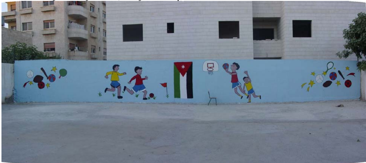
Anas Ben Malek Center Mural Project Wadi Seer 2006